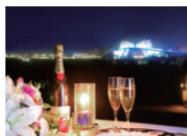
Tokyo Bay view