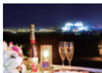
Tokyo Bay view