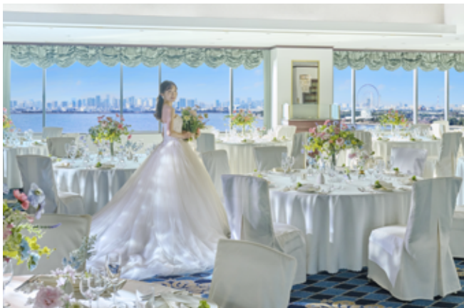
Nice view location in Maihama