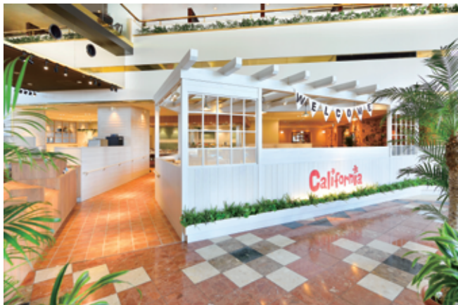
All Day Dining CALIFORNIA