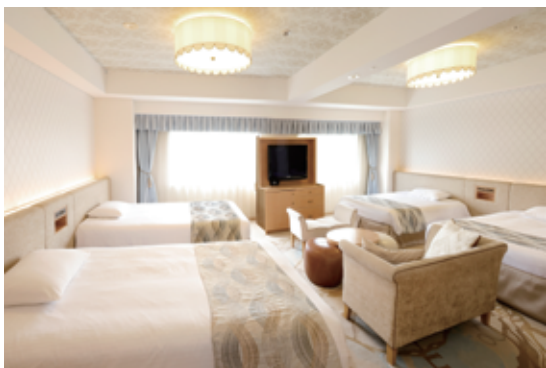
Deluxe Family Room