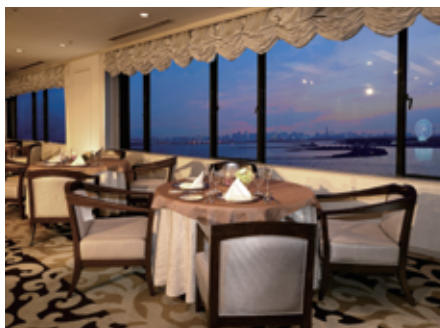
Sky Restaurant SUNSET

Table service or buffet in “All Day Dining CALIFORNIA”, French cuisine in “Sky Restaurant SUNSET” located on the top floor.