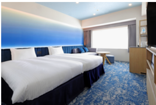
Royal Anniversary Suite