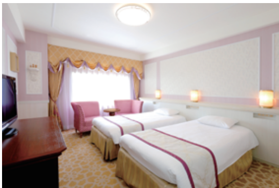
Moderate Room (Castle Style)

Various concept rooms as if to spend time in castle, western adventure and “American dreams in 1950s”.