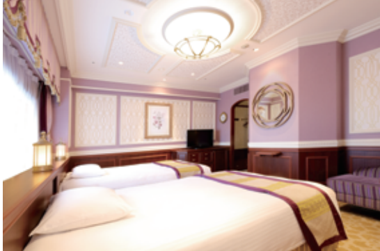
Superior Room (Castle Style)