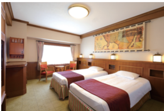
Moderate Room (Western Style)